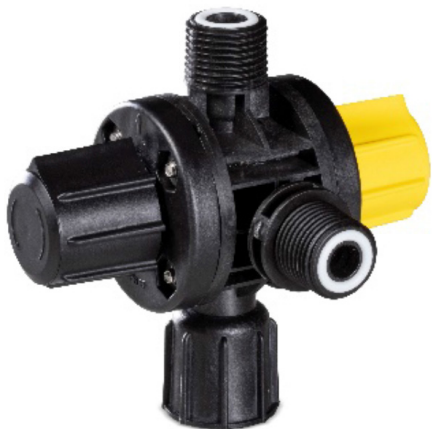
Body Material: PVDF