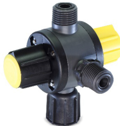
Body Material: PVC

Designed for Sodium Hypochlorite Applications